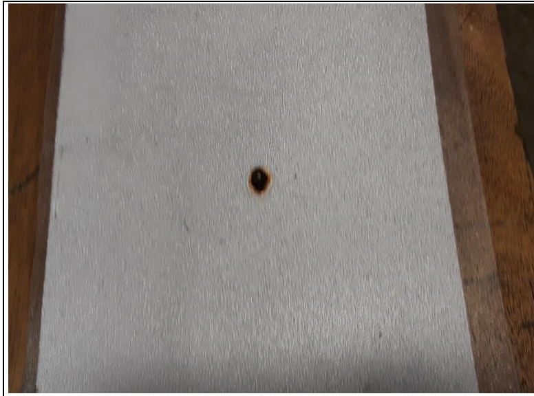
Photo No. 1 Sample After Test